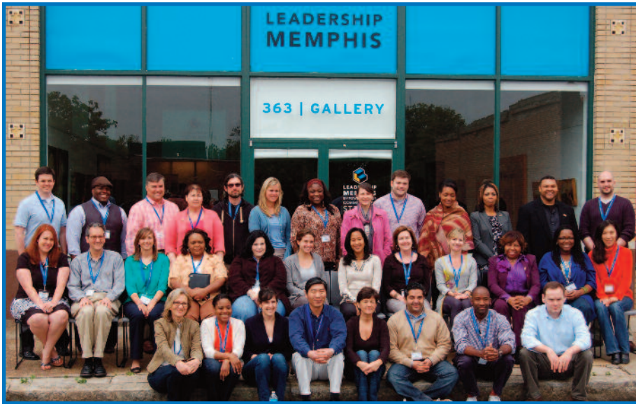
FastTrack graduates pose for a class photo.