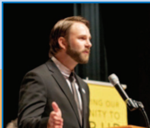
Stand for Children was presented the Community Champion Award