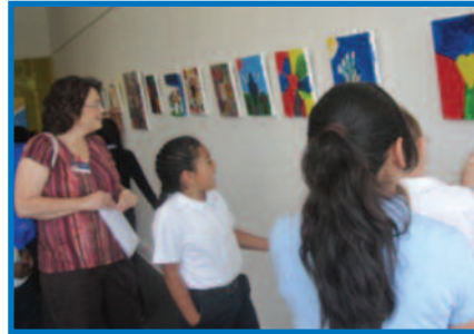
Jubilee School students made a field trip to see their art hanging in a "real gallery."