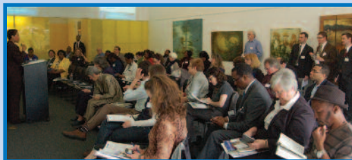
This Federal Reserve event was one of several meeting and seminars that have been held in the space using a theater-style seating arrangement.