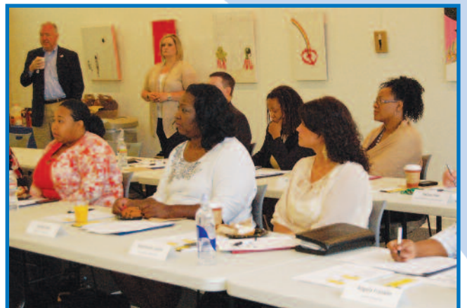
Graduate Memphis advisors supplied by area colleges and universities were trained on how the program works.