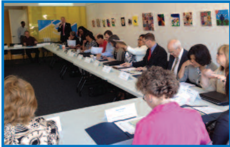
The gallery/meeting room can be configured in many different ways.