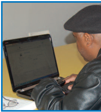
The Community Counter is available to alumni and partners.