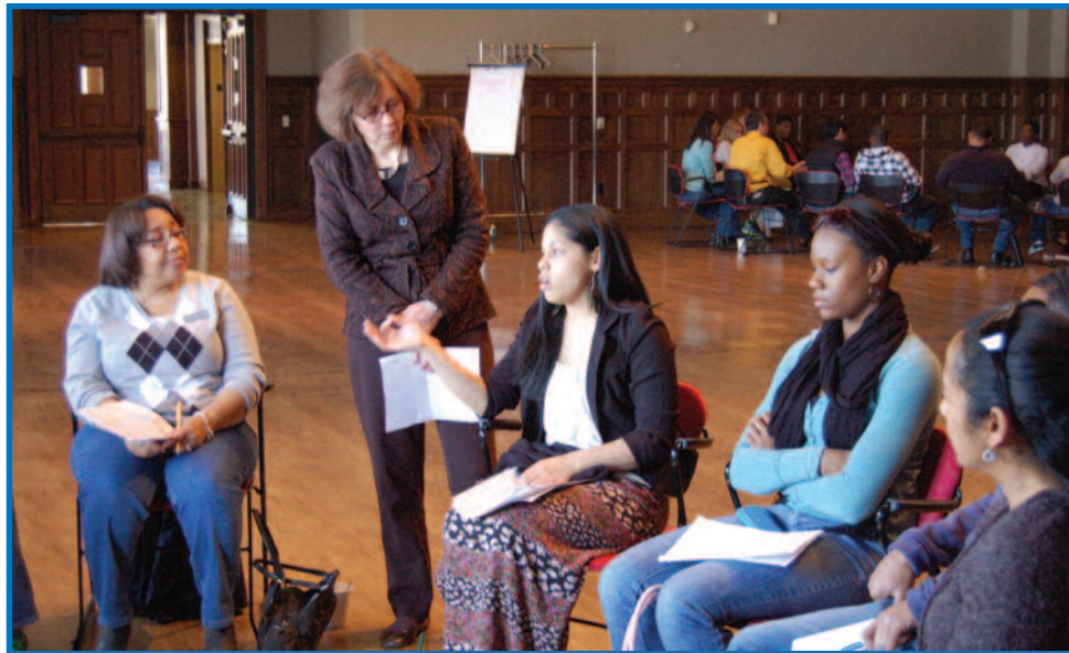
An Imagine Memphis session was held at Rhodes College.