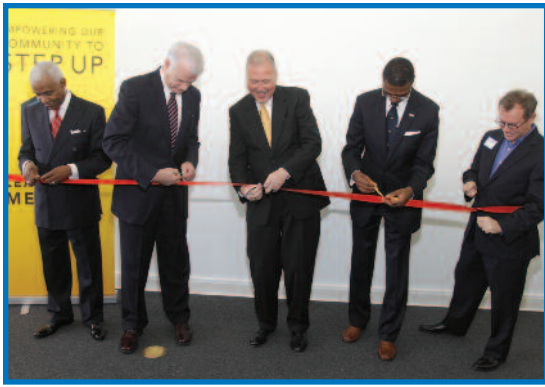
The office was open with a ribbon tying event rather than a ribbon cutting.