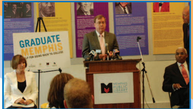
A press conference held at the library to announce the Plough Foundation's support and plans to move forward with the College Resource Center.